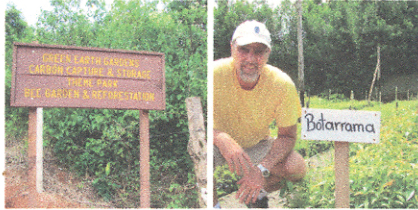
2010 Native Tree Planting

Reduction: Nov 1, 1998 to Dec 31, 2013 Location: North Florida, US, British Columbia, CA, Alajuela, CR