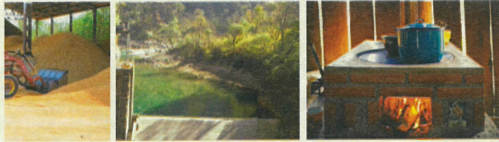
High Efficiency Cooking Stoves, Biomass to Energy, and Small-Scale Hydro Power

Reduction: Jan 1, 2013 ~ Dec 31, 2022 Location: Brazil, India, Mexico